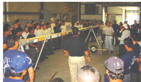
Demonstrating the correct assembly of a portable outrigger system to meet safety codes.

We are also very proud to be a client of DrugFreeBusinessHouston. A drug-free workplace is an intricate part of our health and safety program.