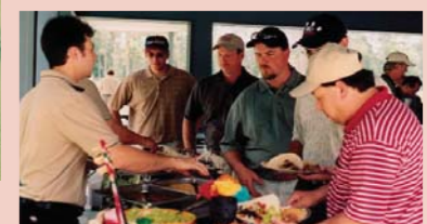
Lots of wonderful cook-off food and fellowship were enjoyed by all.