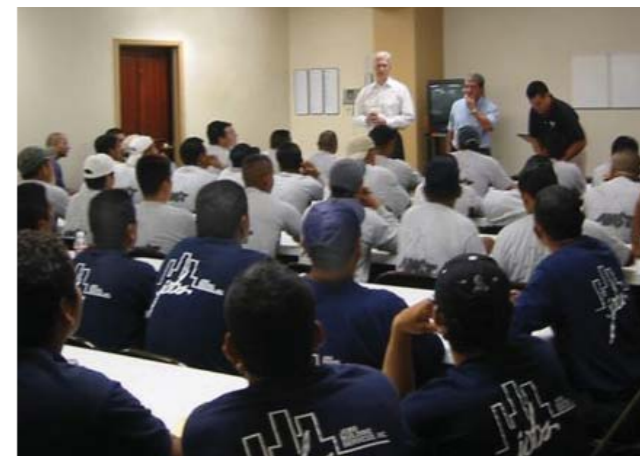
Full-day OSHA course in the JOBS/AMST Training Facility.

State and federal law, as well as our JOBS/AMST company policy, make safety and health an integral part of every operation. On August 30, 1996, OSHA passed a new scaffolding regulation. It requires training for anyone who erects, dismantles, moves, alters, maintains, repairs, or inspects scaffolding (1925.454(b)). At the end of the full-day OSHA safety course in August, all employees attending were required to pass a written test and were issued pictured ID certification cards to verify their new safety training credentials.